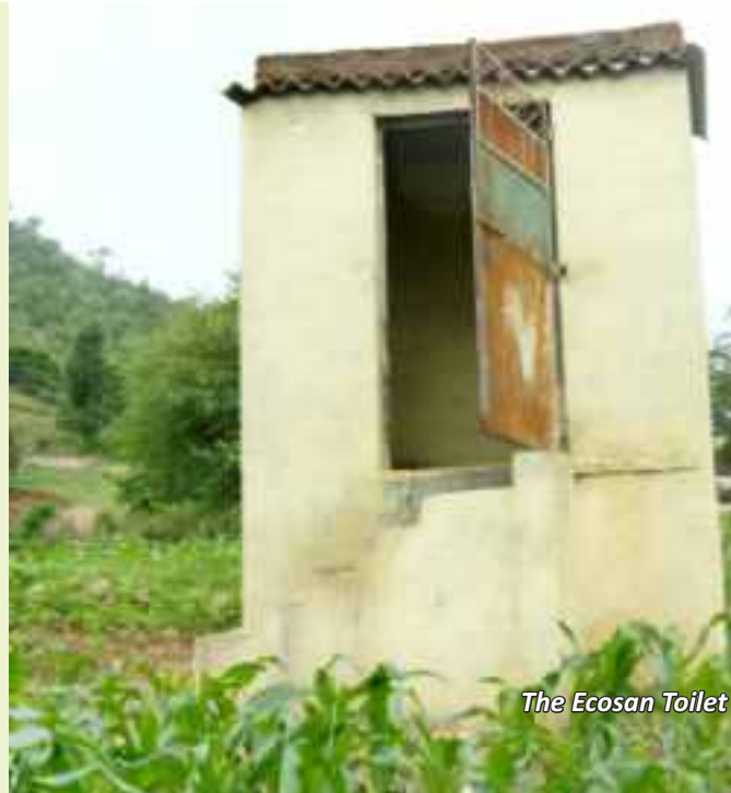
The Ecosan Toilet